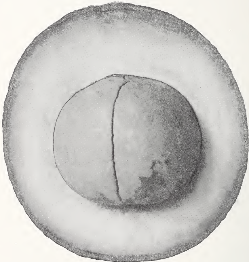
Fruit of the Linda Variety, Actual Size—Seed 15%.